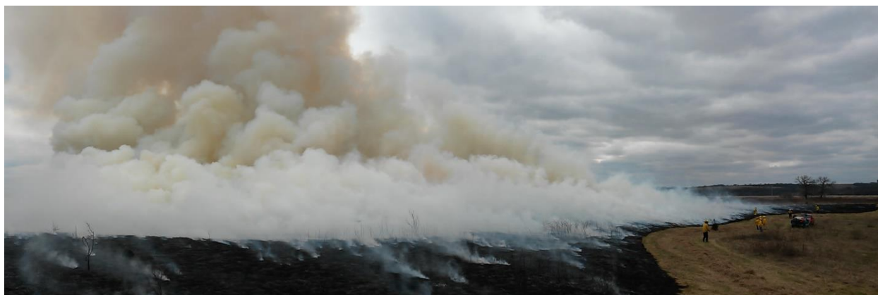
A ring fire nearing completion, showing convective heat drawing all fire to the interior. Conducted by volunteers of The Prairie Enthusiasts in Green County, WI.

Ring fire is a term for a sequence of ignitions that ultimately surround the burn unit with fire on all sides, and the various ignitions are purposely conducted and timed so that all fires draw inward at completion.